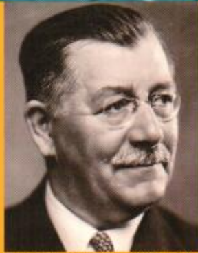
Ernst Schmidheiny 1871–1935